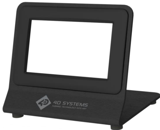
Development Stand with Black Bezel (DS-43-BB)

For more information regarding the Bezels, please refer to the Datasheet for the 4DBEZEL-43, available from the 4D Systems website.