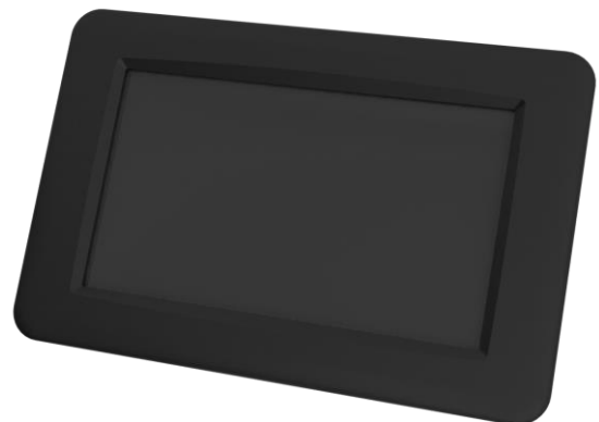
uLCD-43 Mounted in 4.3" Bezel - Front (Display module not included)